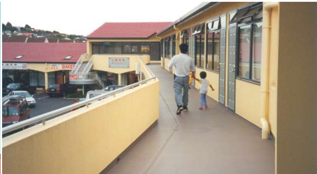
Shopping Centre Walkway, Auckland