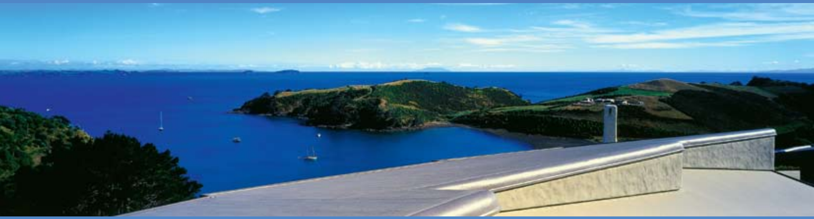
Delamore Lodge, Waiheke Island