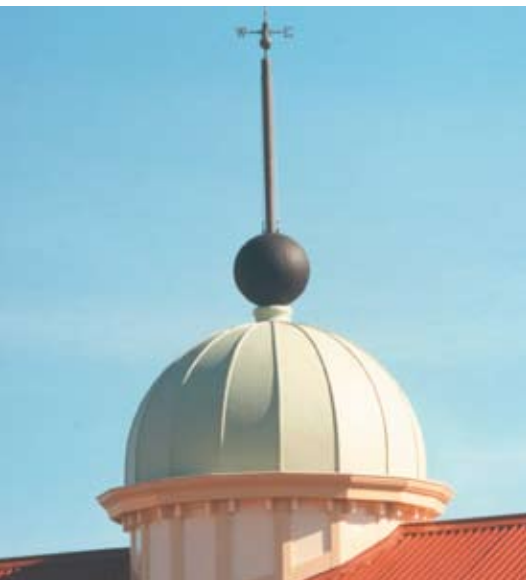
Timeball plywood dome, Whangarei