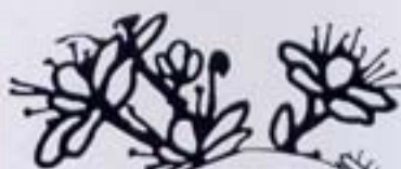
Cherry Blossom Girl Paper Lashes, $4.50