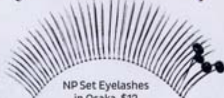
NP Set Eyelashes in Osaka, $12