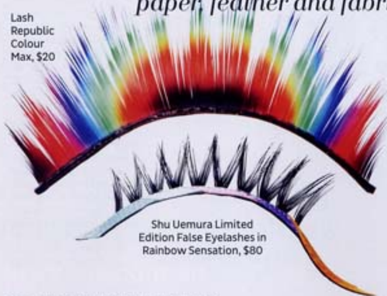
Shu Uemura Limited Edition False Eyelashes in Rainbow Sensation, $80