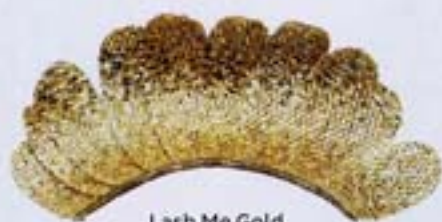
Lash Me Gold Glam Reusable Eyelashes, $9.95