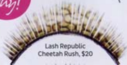
Lash Republic Cheetah Rush, $20