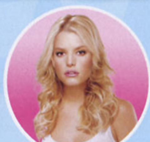
5 pc system