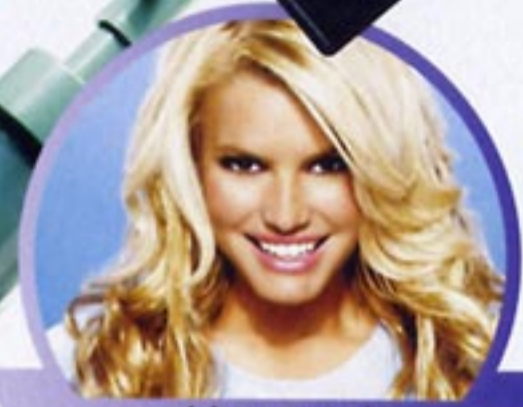
celebrity made by JESSICA SIMPSON